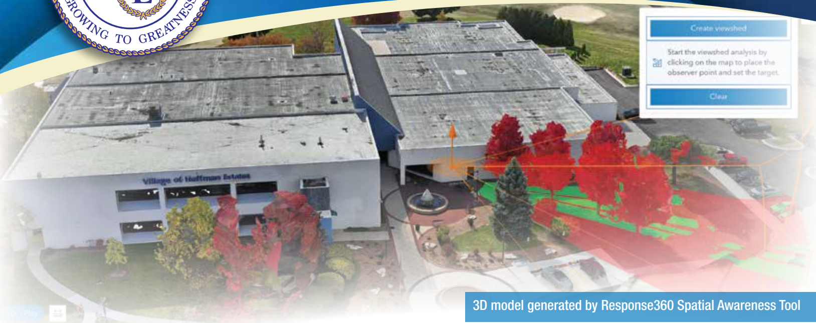
3D model generated by Response360 Spatial Awareness Tool